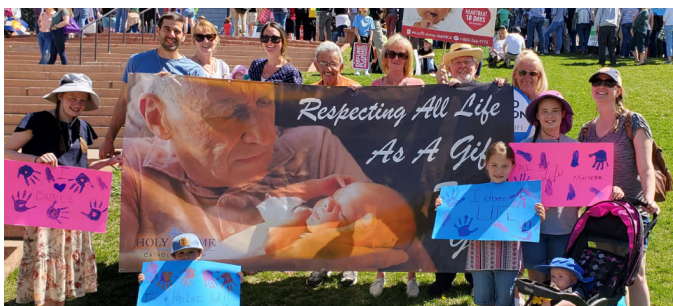
^ The March for Life happened on April 11th. We had several Holy Name Parishioners there to support the sanctity of life.