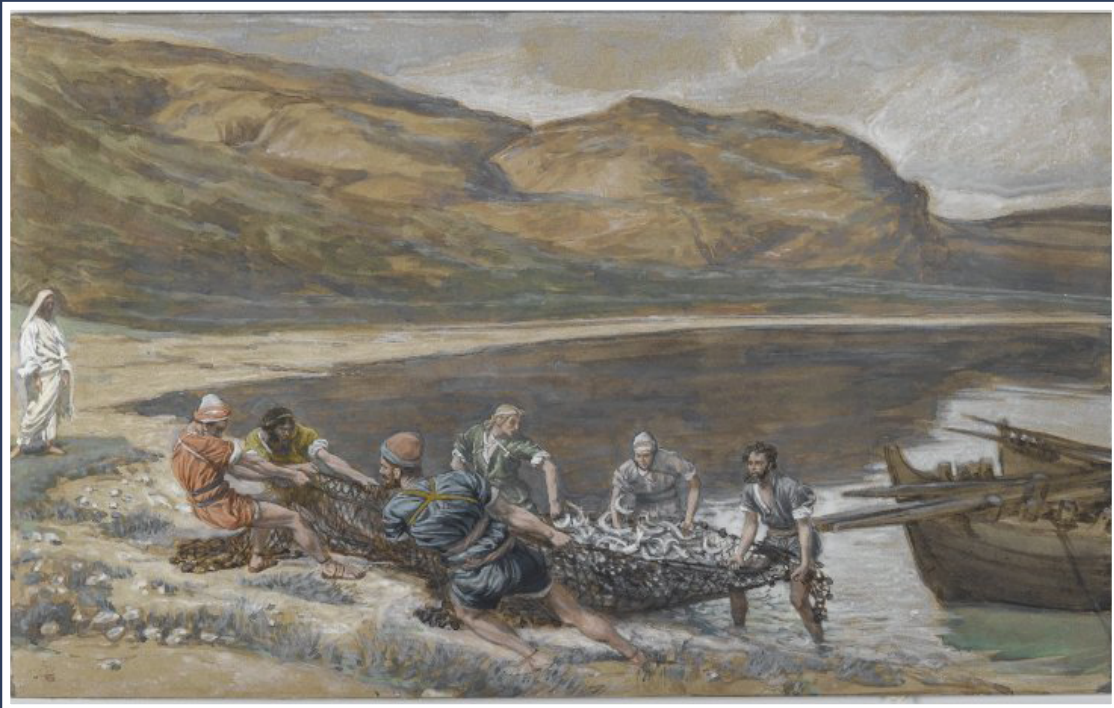
The Second Miraculous Draught of Fishes | James Tissot | c. 1886