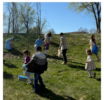
Parishioners gather at the Easter Vigil v

900 eggs were hidden (and hopefully all found!) in the Easter Egg hunt after the 8:00 AM Mass on v Easter