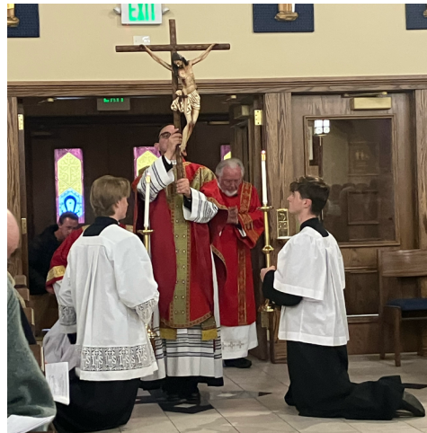
< The Celebration of the Lord's Passion on Good Friday.

Received their Sacraments of Initiation: Baptism, First Holy Communion & Confirmation at the Easter Vigil on Saturday, April 19 th